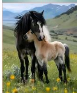
Baby Animals and their Moms

The Department of Revenue will start sending payments July 1.