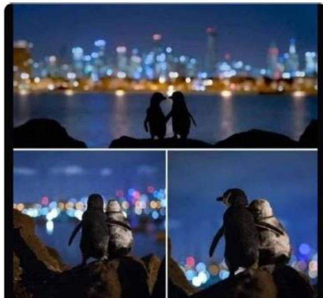
Abandoned Beautiful World July 18 at 1:58 PM · 🌐