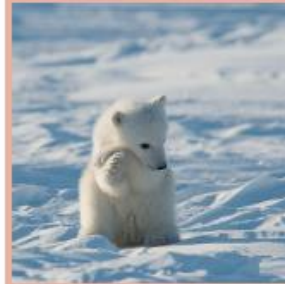
Be kind to all animals